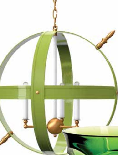
Oomph "Cambridge III" Armillary Sphere in Parakeet $2,495 www.oomphonline.com