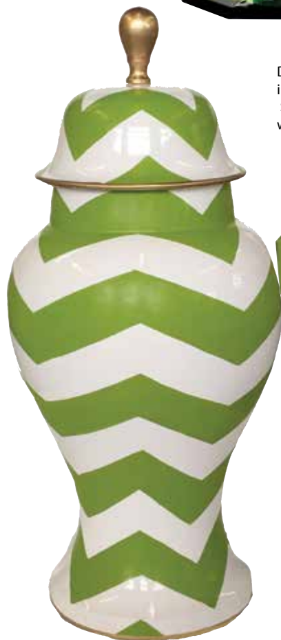
Dana Gibson Ginger Jar in Green Bargello $225 www.danagibson.com

"Posie Dot" in Picnic Green by Kate Spade for Kravet ( www.karensaks.com )