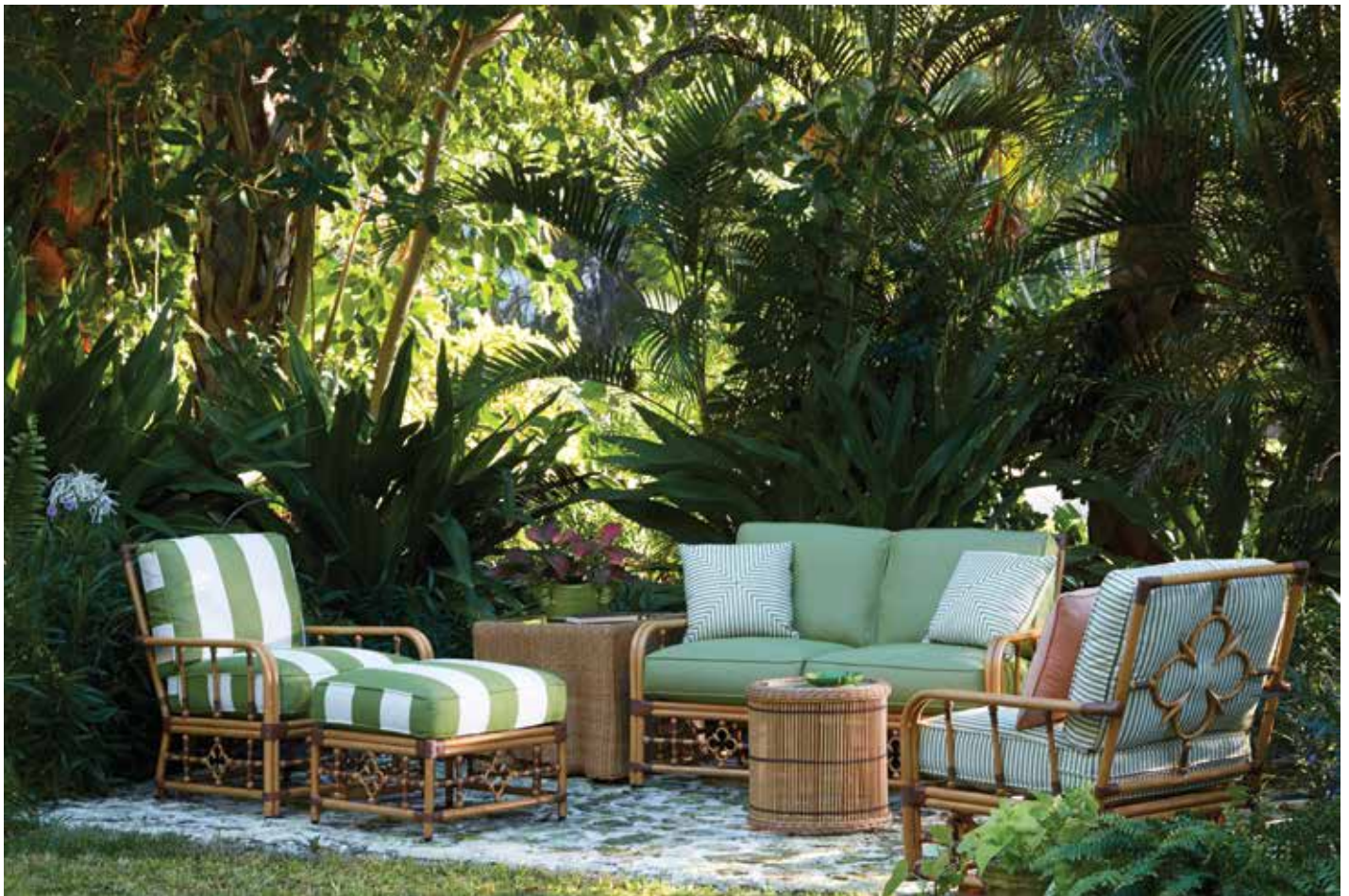
Lane Venture "Mimi" Collection by Celerie Kemble shown in Sunbrella's "Armada," "Hollis," and "Scene" fabrics all in Cilantro green.