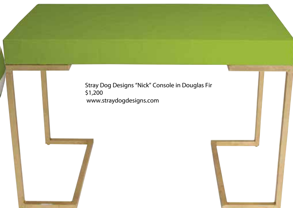
Stray Dog Designs "Nick" Console in Douglas Fir $1,200 www.straydogdesigns.com